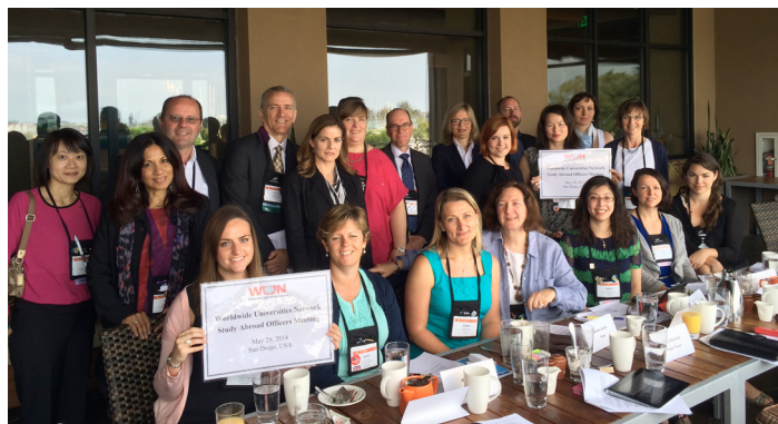
WUN delegates attending the 2014 NAFSA Conference in San Diego, USA.