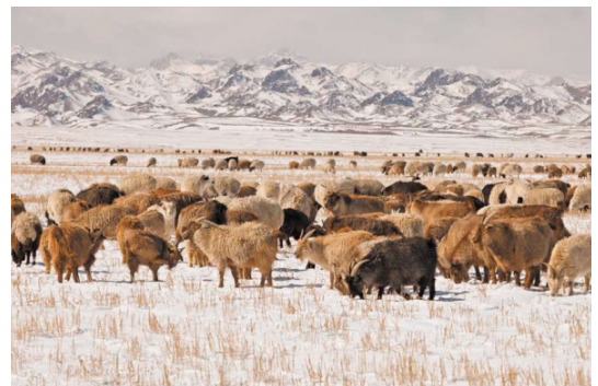
Domestic goats and sheep can graze marginal lands, such as those in the Gobi Desert in Mongolia.

The Shaping Health Systems Network - a collaboration between Leeds, Sydney and Alberta that examines primary healthcare systems - published an article in the Australian Health Review titled Governance, transparency and alignment in the COAG 2011 National Health Reform Agreement .