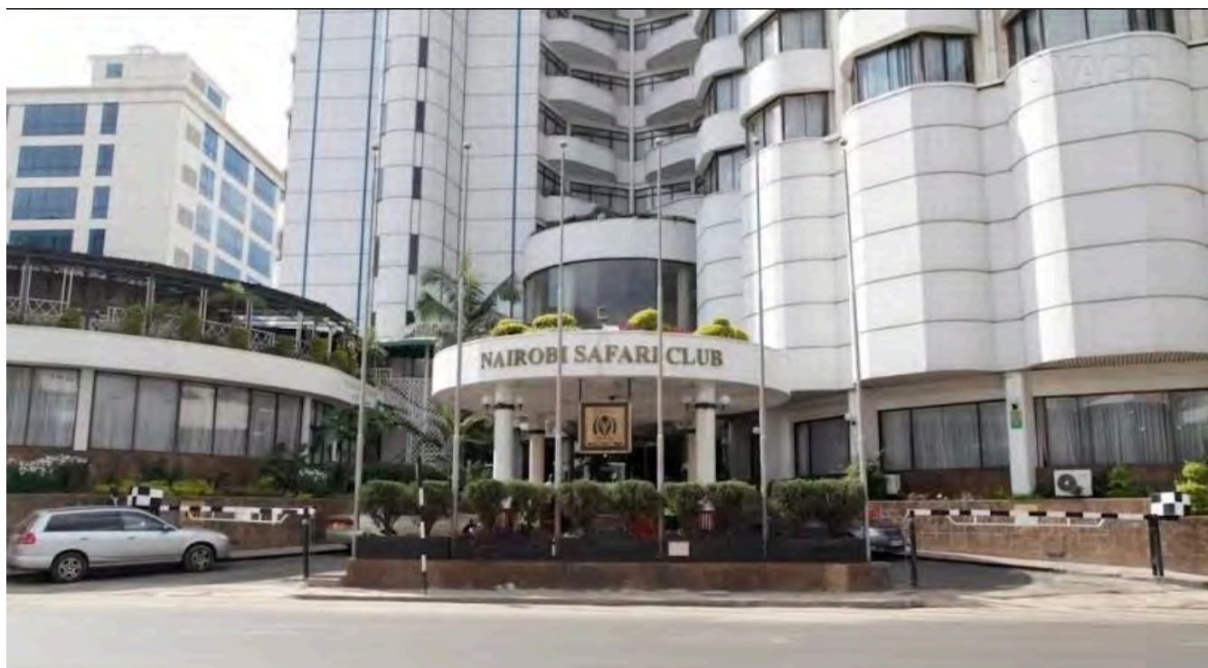
Workshop hotel and dinner venue: Nairobi Sarfari Club