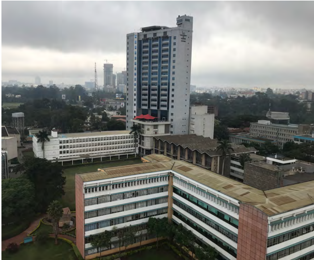
Workshop venue: University of Nairobi Towers

The University of Nairobi, a body corporate established under the Universities Act 2012 of the laws of Kenya and the University of Nairobi Charter, is the pioneer institution of University education in Kenya and the region.