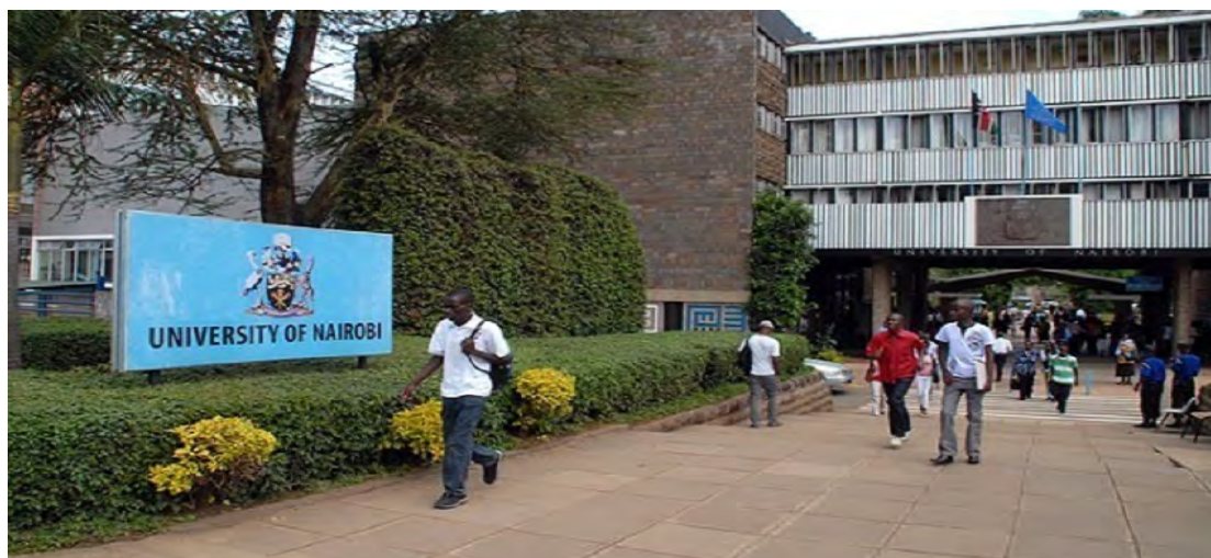
Main entrance: University of Nairobi campus