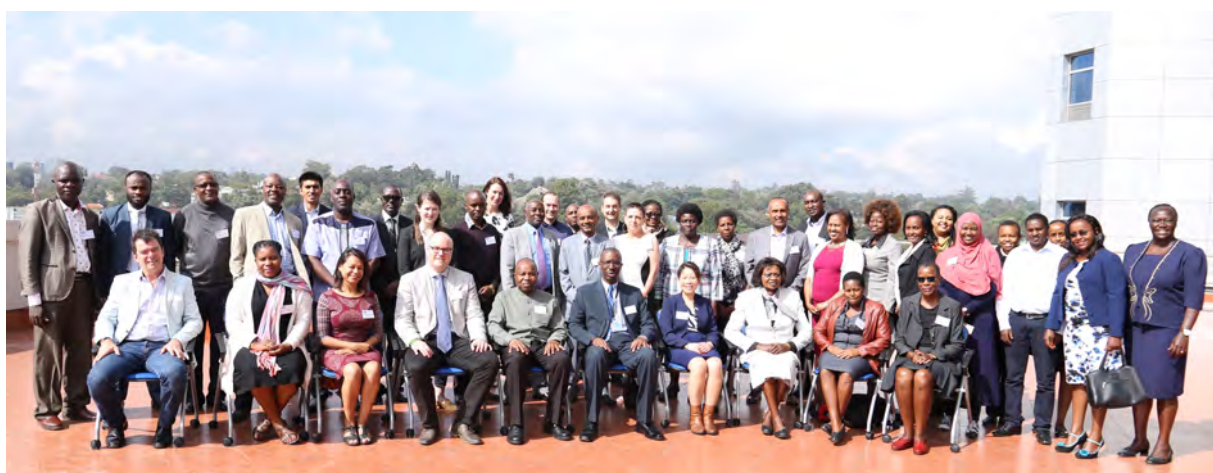
Workshop participants, University of Nairobi Towers, 29 November 2018

Implementing the SDGs in East Africa: Translating collaborative research into policy impact