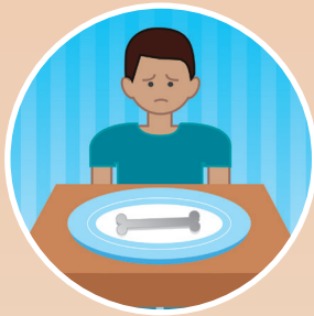
High levels of undernourishment