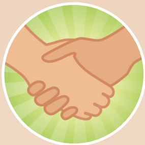
Environmental governance needs to be more effective