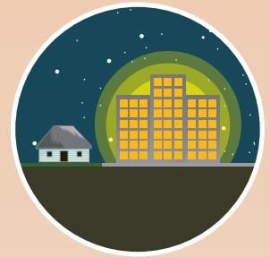
Access to modern sources of energy is limited in isolated regions