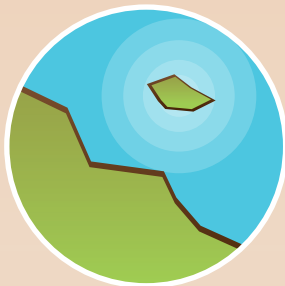
The challenge of geographical isolation requires focus on remote areas for promoting sustainable development