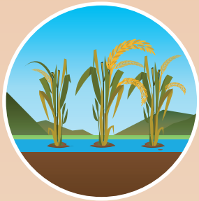
Major food insecurity hotspot