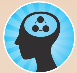
Nexus thinking can support effective management of water, energy and food systems