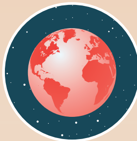
Climate change adaptation needs a bottom-up approach