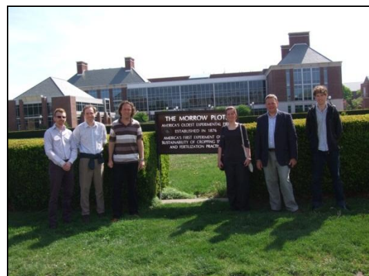
Visit to the oldest experimental cornfield plot in the western hemisphere and the second oldest in the world (dating from 1876)