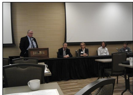
A seminar being delivered at UIUC